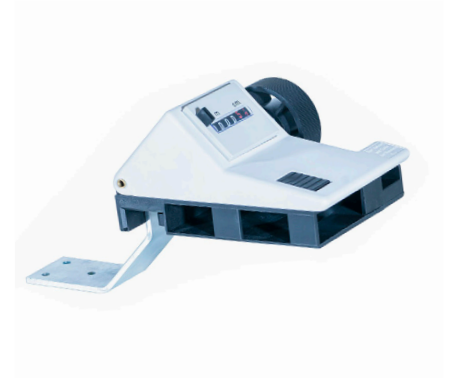
Fig. 3 MESSBOI 10 with mounting bracket