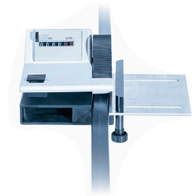
Fig. 5 MESSBOI 10 FLA for flat material