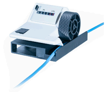
Fig. 2 MESSBOI 10