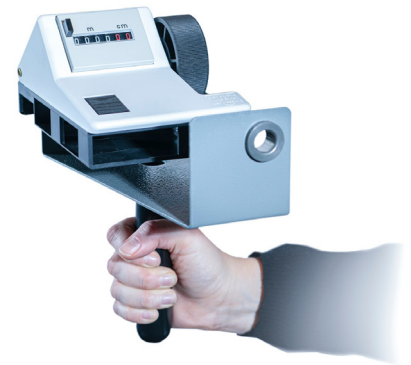
Fig. 4 MESSBOI 10 HT with hand grip