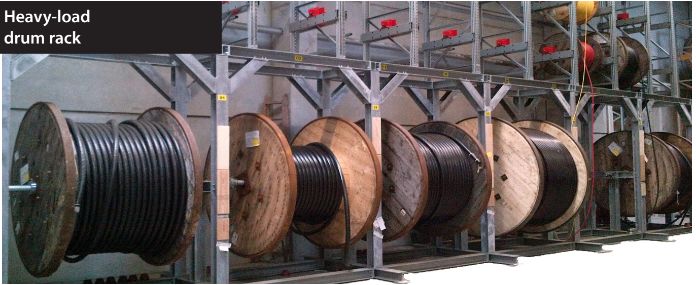
Fig. 1 ABROL heavy-load drum rack combined with LAGROL drum rack