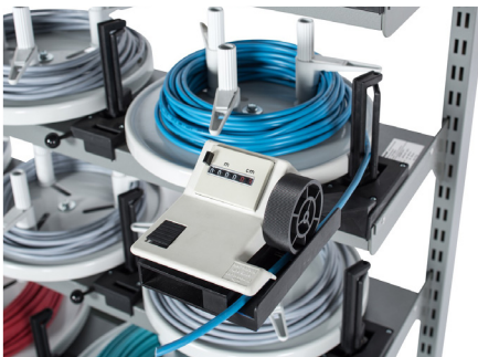
Fig. 8: MESSBOI 10 H