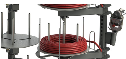
Abb. 10: Holder for MESSBOI 25 at MATBOI storage rack