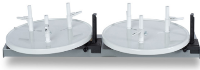
Fig. 7: MATBOI 450 T