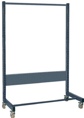
Fig. 3: Storage rack 650