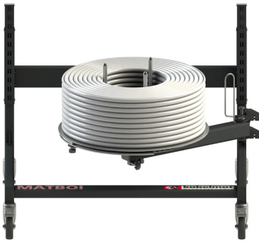
Fig. 12: MATBOI 650 T right