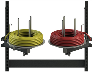
Fig. 11: MATBOI 450 T