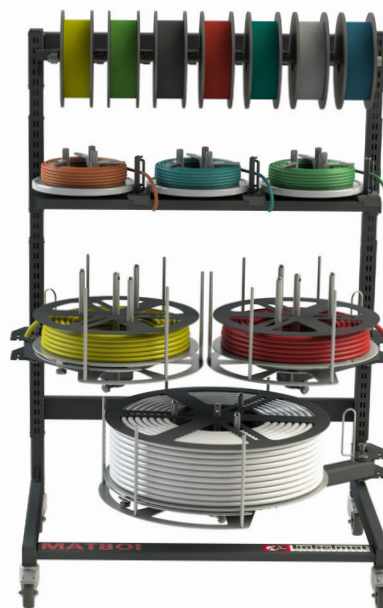
Fig. 1: MATBOI / SPULBOI Combination

» Find more information at SPULBOI storage system