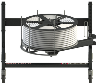
Fig. 14: MATBOI 650 T right with bouncing protection