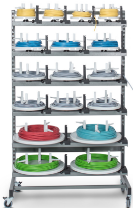
Fig. 2: MATBOI complete device