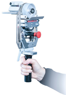
Abb. 9: MESSBOI 25

With holder to attach to the unwind unit.