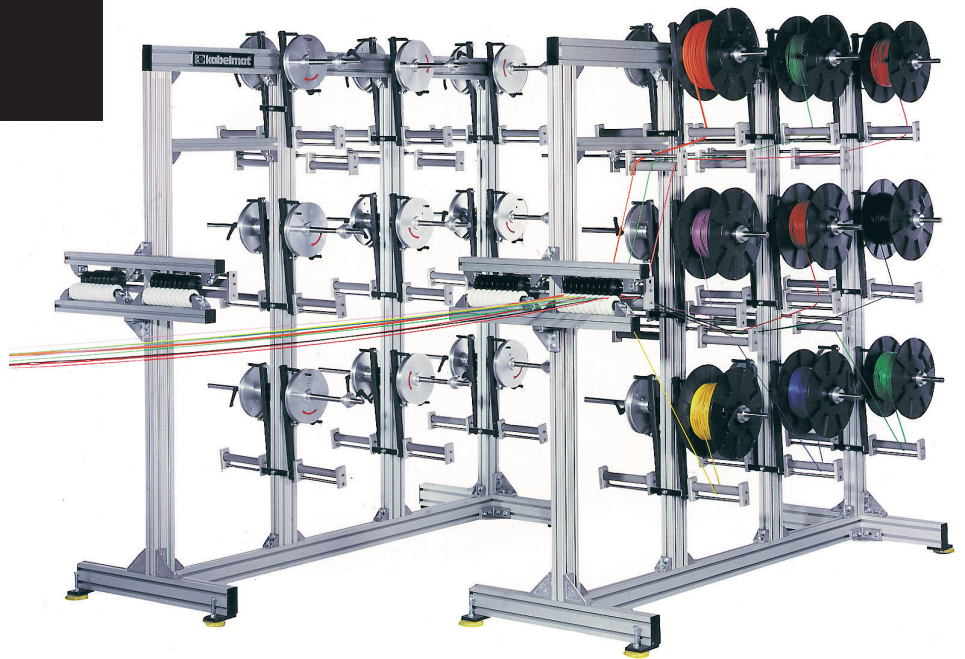
Fig. 1 SPULROLLY example for arrangement with split pair coils

Spool storage device with central material outlet