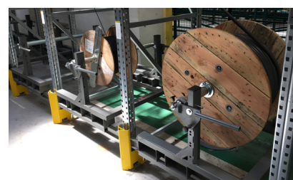
Fig. 3 TROMTRAK 1000 drum storage device in use