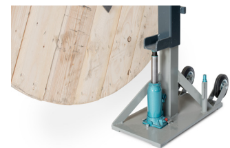
Fig. 3 Hydraulic hand pump