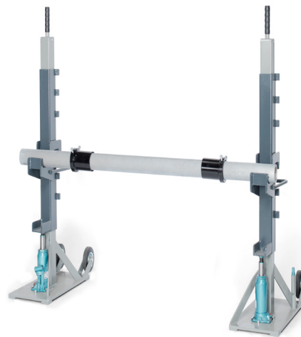
Fig. 2 TROMBOI 2003