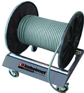
Fig. 2 TROMBOI 500 MOBILE