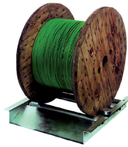
Fig. 3 TROMBOI 800