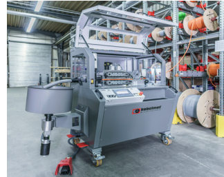
Fig. 4 AUTOCUT 40 with open protective cover