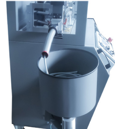
Fig. 5 Pot winder with adjustable drive motor