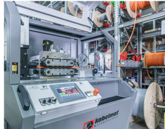
Fig. 3 Control panel with touch panel control and regulated positioning servo drive