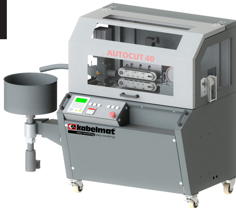
Fig. 1 AUTOCUT 40 with closed protection cover