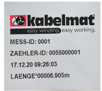
Fig. 5 Label sample