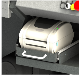
Fig. 4 Label printer