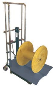
Fig. 3 Lift-type device for drums