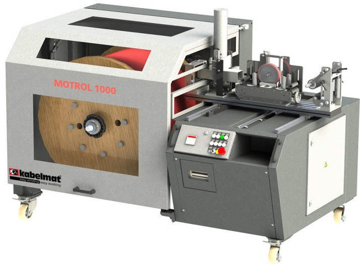
Fig. 1 MOTROL 1000

Winding machine in a perfect combination