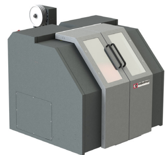
Fig. 3 TROMPIN 800 with closed safety doors